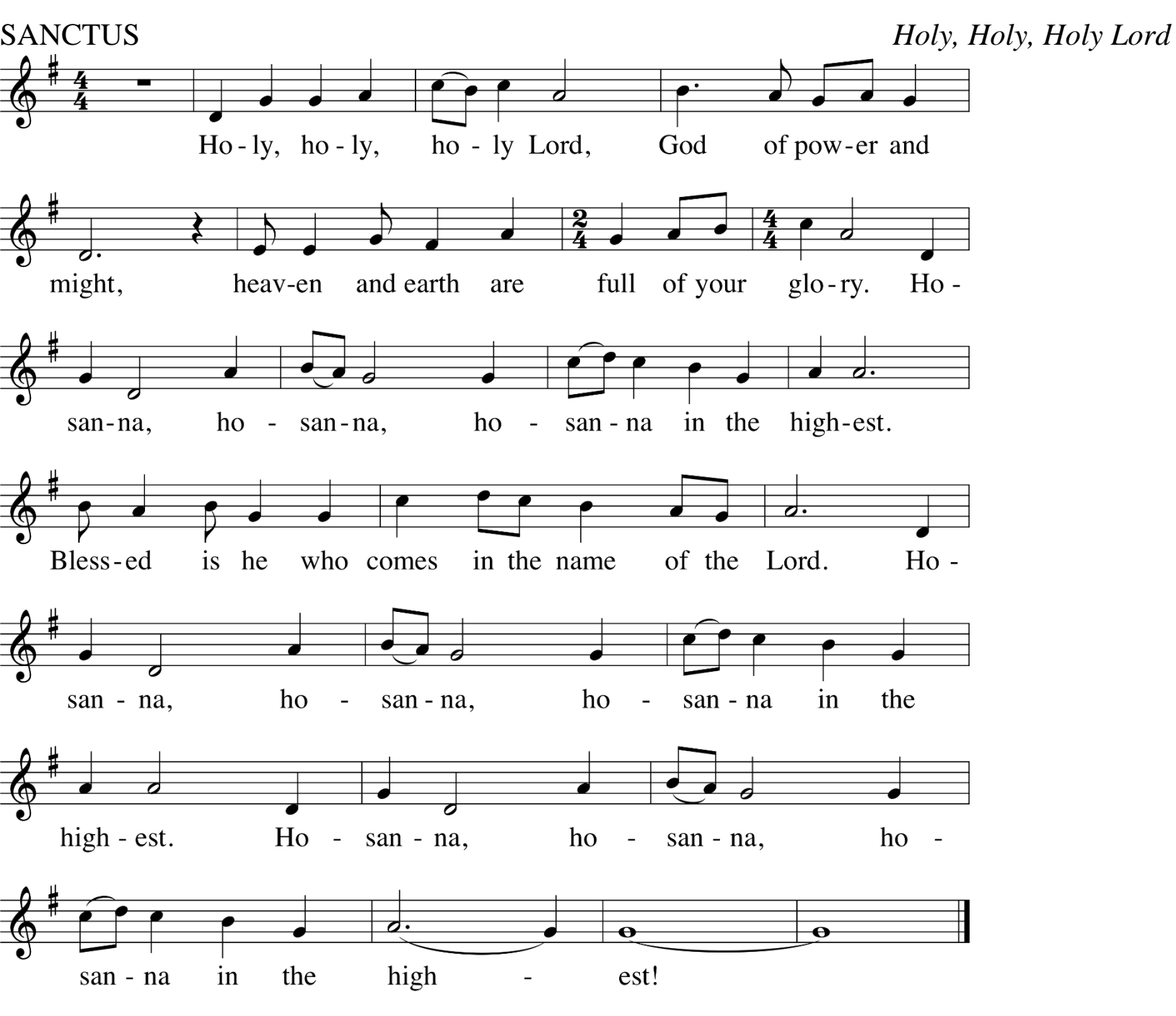
Presider: Therefore, we praise you, joining our voices with Angels and Archangels and with all the company of heaven, who for ever sing this hymn to proclaim the glory of your Name: